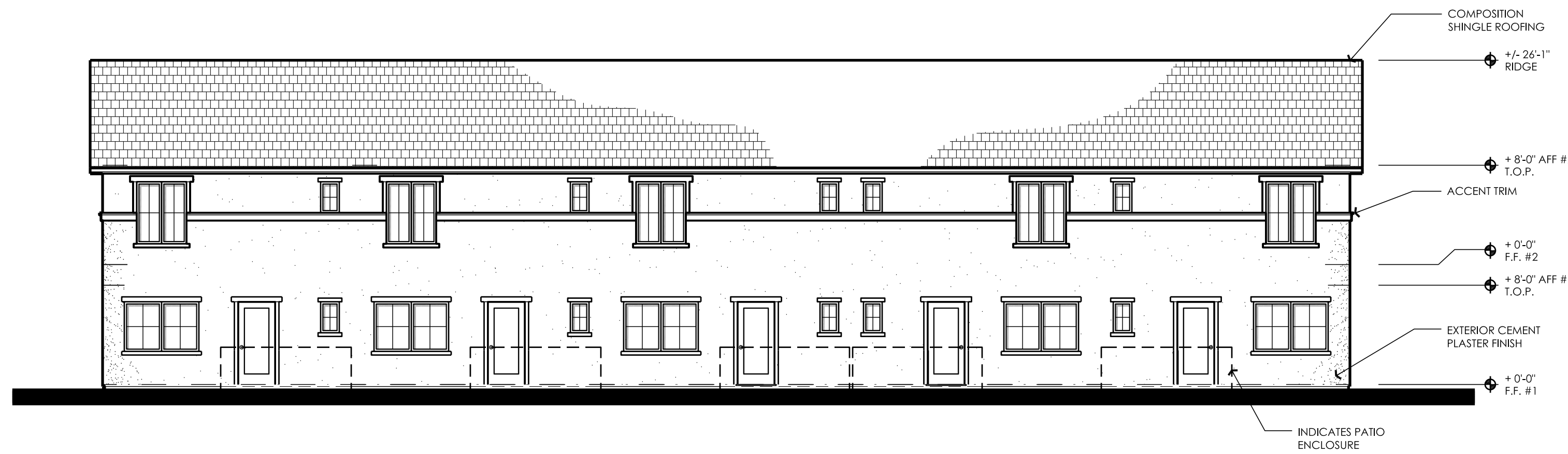
BUILDING 3 REAR EXTERIOR ELEVATION