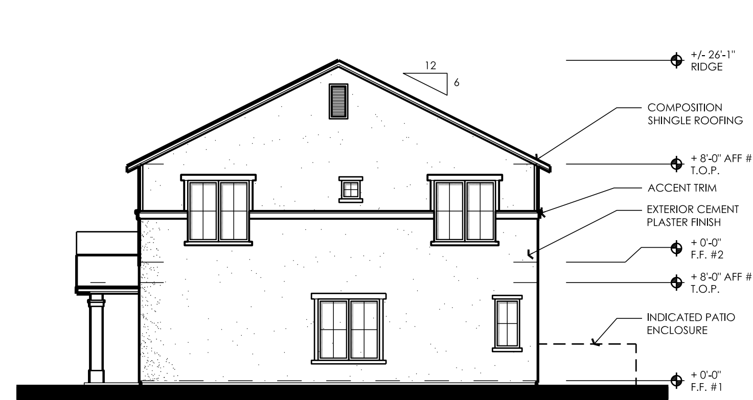
BUILDING 3 SIDE EXTERIOR ELEVATION