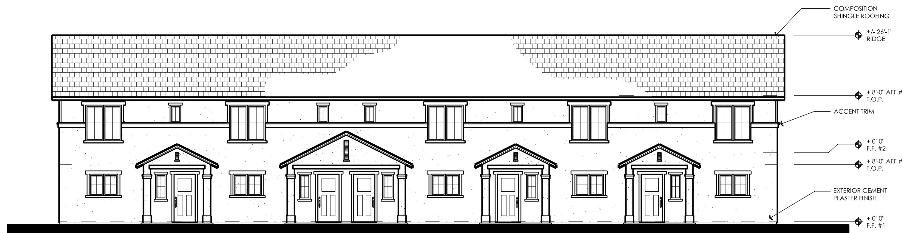
BUILDING 3 FRONT EXTERIOR ELEVATION