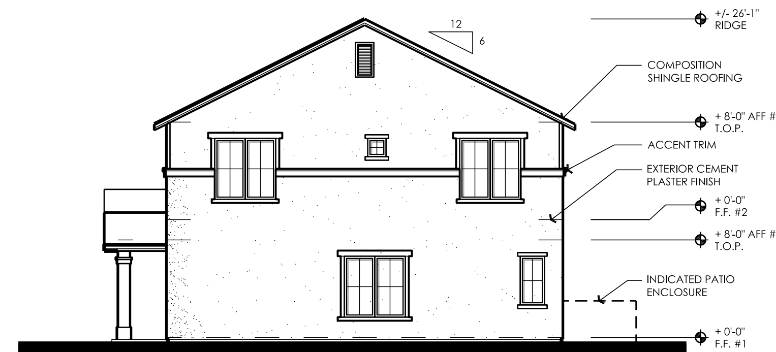
BLDG. 2 SIDE EXTERIOR ELEVATION