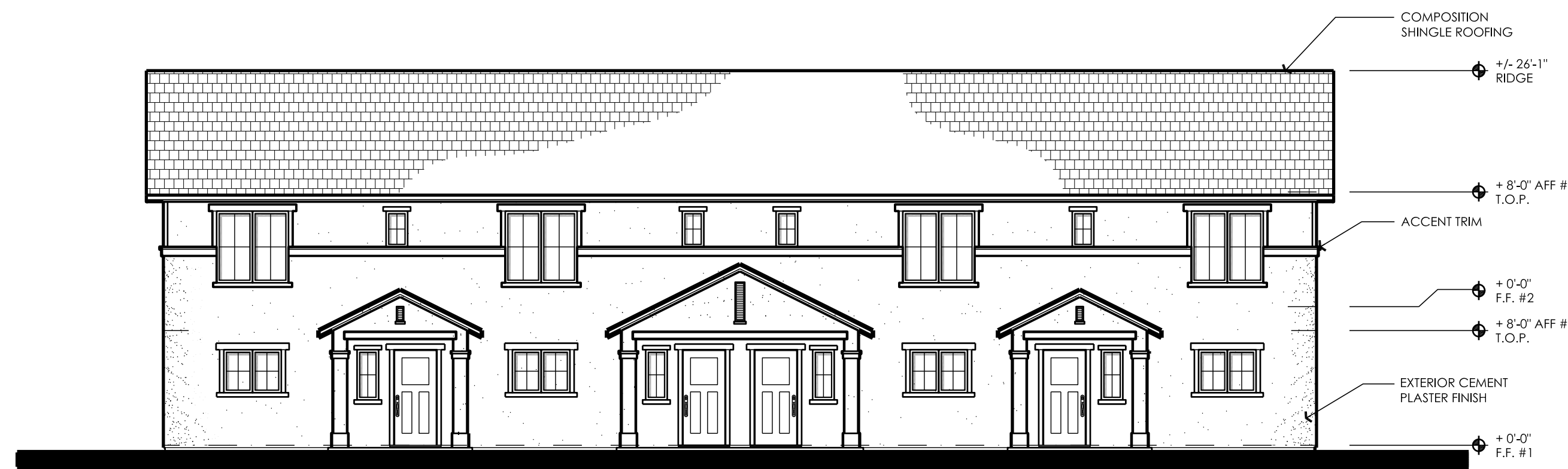
BUILDING -1 & 2 - FRONT EXTERIOR ELEVATION