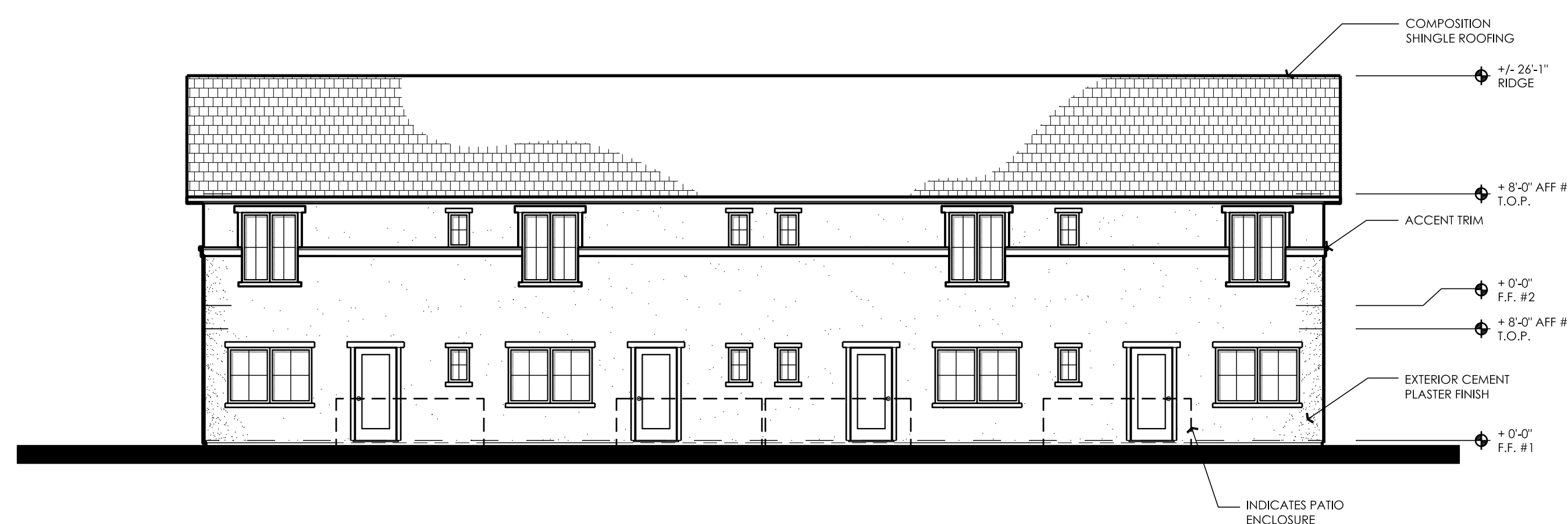
BUILDING -1 & 2 - REAR EXTERIOR ELEVATION