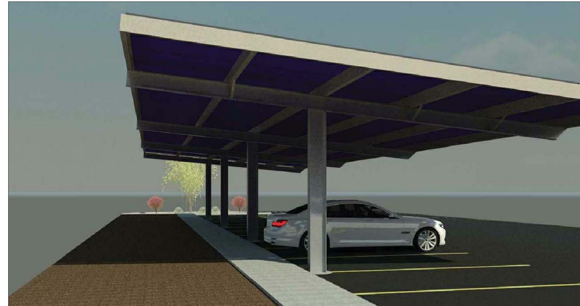
2 SOLAR STRUCTURE RENDERING SCALE: N.T.S.