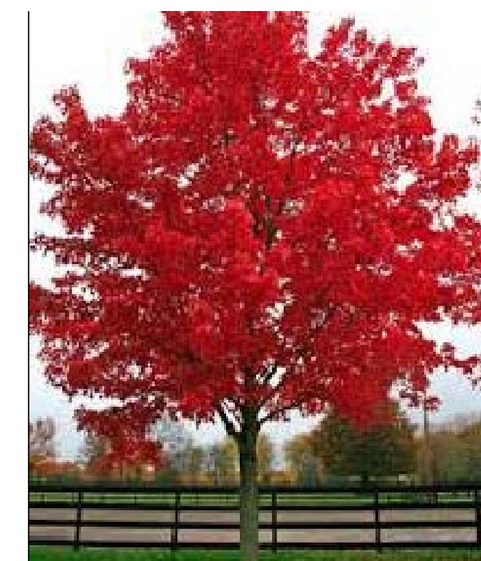
STREET TREE: ACER FREEMANII 'RED SUNSET' (RED SUNSET MAPLE) DECIDUOUS CANOPY TREE; 45-50 FT. HEIGHT