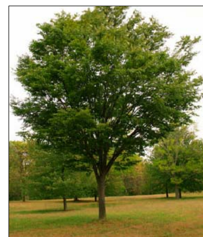
STREET TREE: ZELKOVA SERRULATA 'VILLAGE GREEN' (ZELKOVA) DECIDUOUS CANOPY TREE; 45-50 FT. HEIGHT