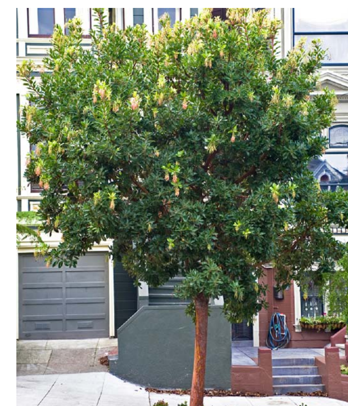
BROADLEAF EVERGREEN TREE: ARBUTUS 'MARINA' (ARBUTUS) BROADLEAF EVERGREEN TREE; 25-30 FT. HEIGHT