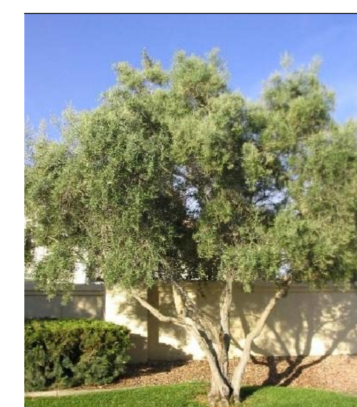
PROJECT THEME TREE: OLEA EUROPA 'SWAN HILL' (FRUITLESS OLIVE) BROADLEAF EVERGREEN TREE; 30 FT. HEIGHT