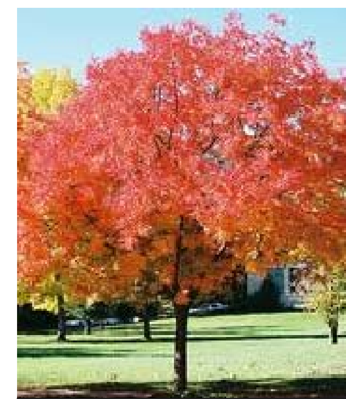
PRIMARY CANOPY TREE: PISTACIA CHINENSIS (CHINESE PISTACHE) DECIDUOUS CANOPY TREE; 30-35 FT. HEIGHT