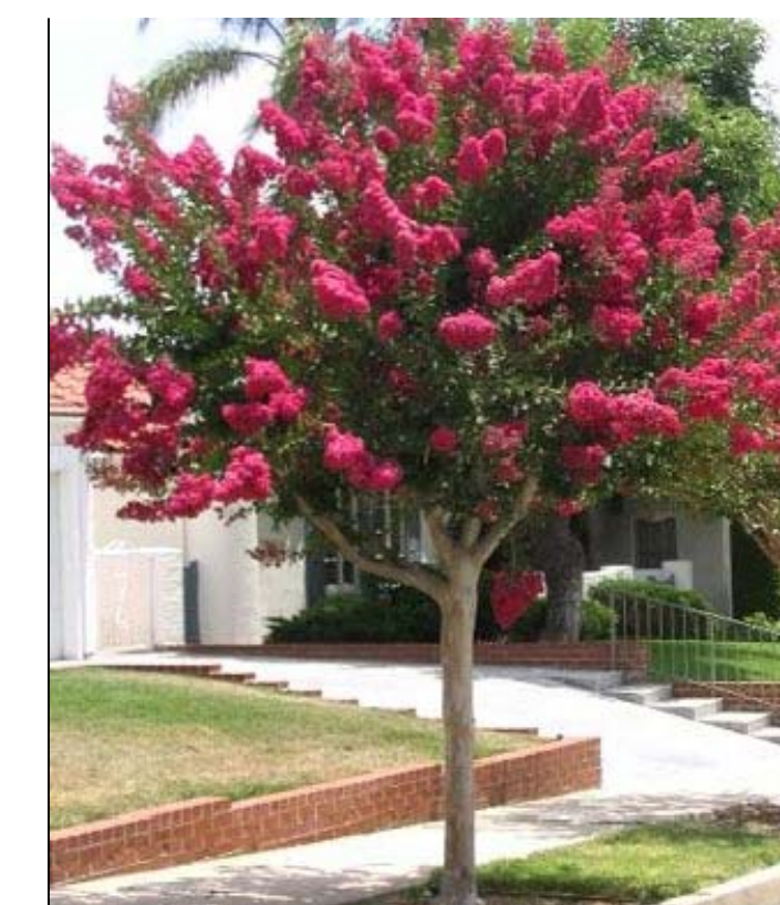
PRIMARY ACCENT TREE: LAGERSTROEMIA INDICA 'TUSCARORA' (CRAPE MYRTLE) DECIDUOUS, FLOWERING TREE; 25 FT. HEIGHT