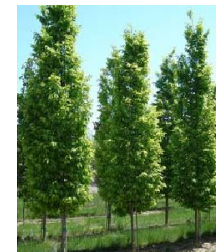
TALL NARROW CANOPY TREE: CARPINUS BETULUS 'FRANS FONTAINE' DECIDUOUS TREE; 30 FT. HEIGHT, 6 FT. SPREAD