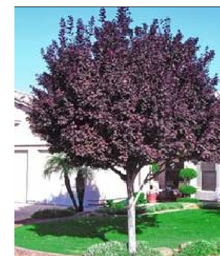
SECONDARY ACCENT TREE: PRUNUS CERASIFERA 'KRAUTER VESUVIUS' (PURPLE-LEAF PLUM) DECIDUOUS, FLOWERING TREE; 20 FT. HEIGHT