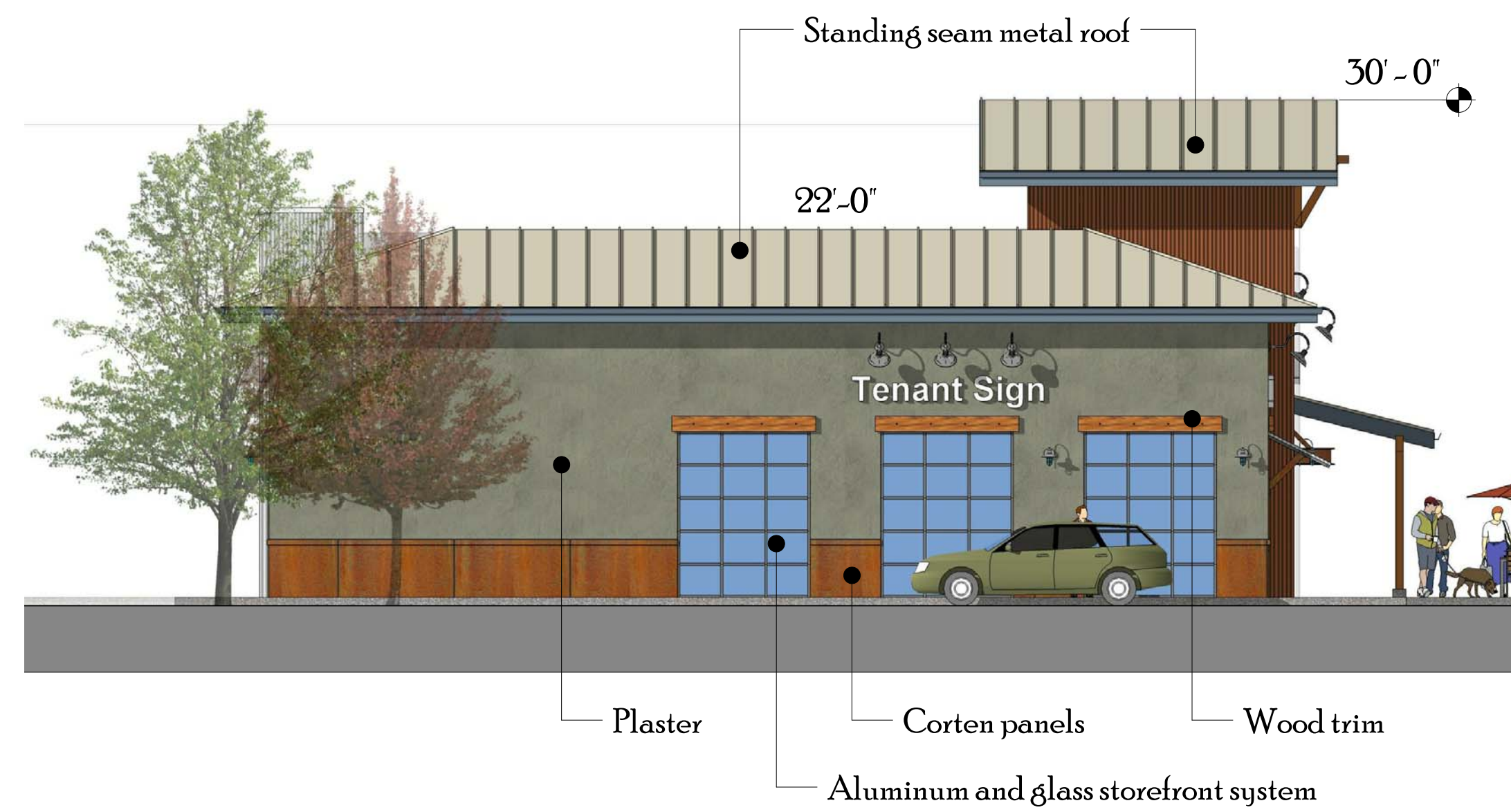
East Elevation ~ Stores 2