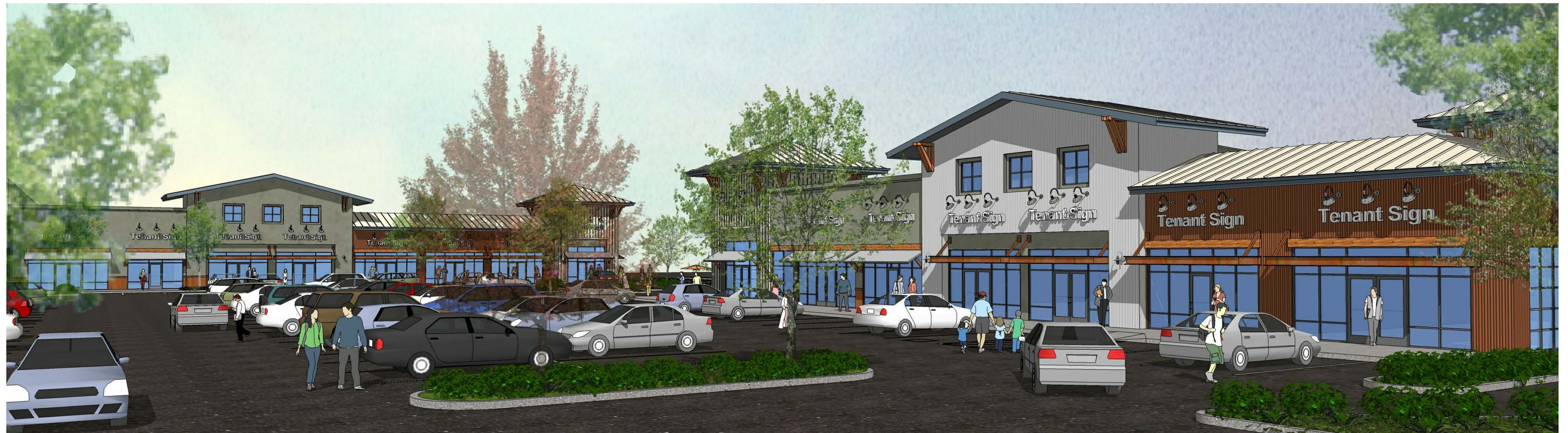
View looking Southwest from West Atherton Drive