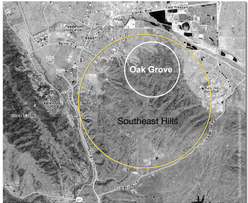
The Oak Grove EIR includes a Google map depicting the location of the proposed development in the southeastern hills of Pleasanton.

If Measure D fails, the current general plan would allow developers to build up to 96 homes on the property; those homes would have to comply with Measure PP. Hosterman said that defeat of Measure D means that the landowners would be free to go ahead with another, larger development. And she said that Measure D could set a precedent