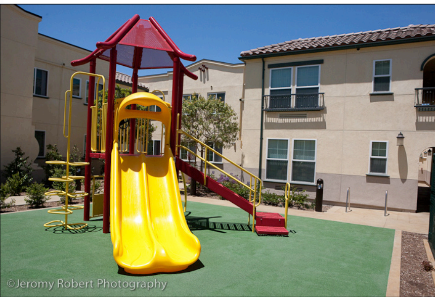
Adobe’s Casa Dominguez complex includes educational programs, sustainable elements, and on-site childcare.

Oh, the injustice of it all! (He beats his breast, producing a hollow sound.) ■