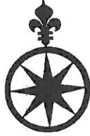
EXHIBIT "A" – Schedule of Charges